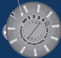
Setting # on the @ease™ SmartChlor™ Cartridge

Set the dial on the bottom of the @ease™ SmartChlor™ Cartridge per the setting chart.