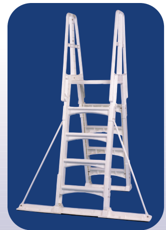
A-Frame ladder with Model AFS10 Stabilizer (sold separately)