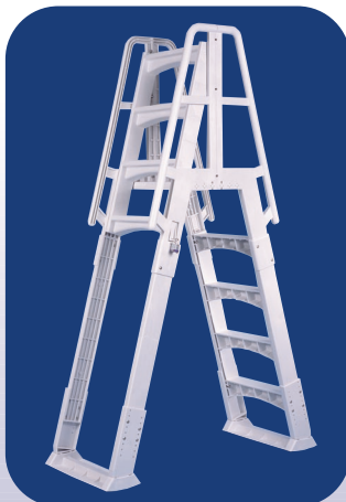
Exterior ladder in up & locked position