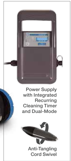
Power Supply with Integrated Recurring Cleaning Timer and Dual-Mode