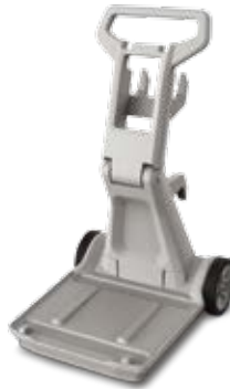
Universal Caddy Cart RC3400CC (Sold Separately with Model RC3431CU)