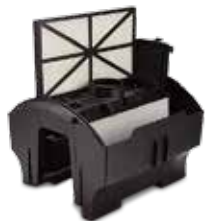
Filter removes easily from filter frame