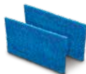
Optional Accessory: Spring Clean-Up Filter Element Model RCX70101