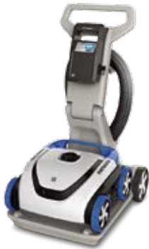
One Complete Cleaner Kit includes Caddy Cart (Model RC3431CUY)

AquaVac 500 RC3431CU (without caddy cart)